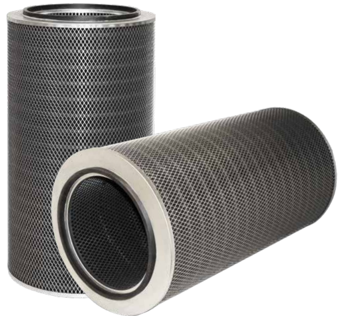
Ultra-Web Conductive FR Cartridge