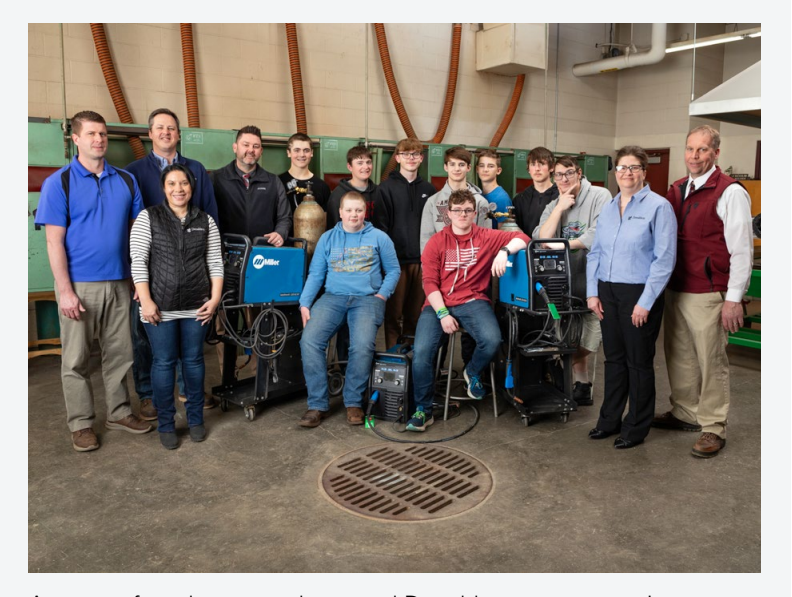
A group of students, teachers, and Donaldson representatives toured the metals lab and the newly acquired equipment, which was funded by a Donaldson Foundation grant.

In addition to the grant, Donaldson has previously provided in-kind welding supplies and given facility tours of the plant in Baldwin, Wisconsin.