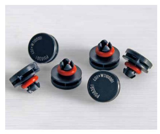
STANDARD SNAP-FIT VENT