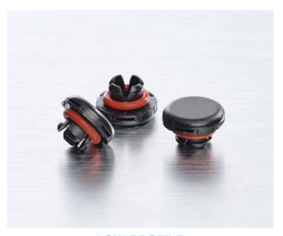
LOW PROFILE SNAP-FIT VENT