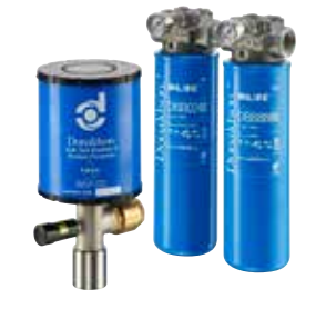
Clean & Dry Kit includes single head (2), high efficiency diesel filter, water absorbing filter, pressure gauge (2) and T.R.A.P. breather.