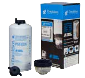
Fuel Filter Kits include Twist&Drain™ filters with standard valve, water collection bowl and alternative valve with WIF sensor or threaded port.