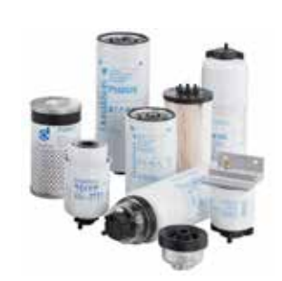
Fuel filters protect engine components and help extend equipment life.

Donaldson filters help prevent injector damage by delivering clean fuel to your engine. They're a better way to filter fuel.