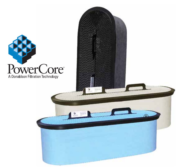
PowerCore® CP Filter Pack (Also available in Standard, Spunbond and Anti-Static)