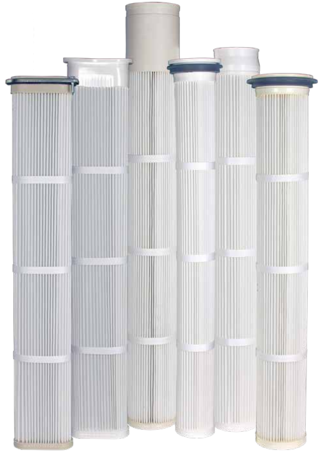
Torit-TEX Pleated Bag Filters