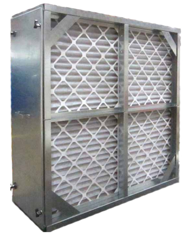
2 x 2 Auto-Lok housing with a prefilter in the upper-right corner

AUTO-LOK<sup>™</sup> AFTERFILTER HOUSING SYSTEM