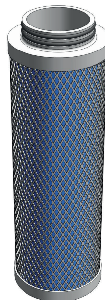
Depth Filter UltraPleat® SMF