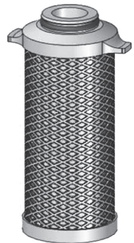
Depth filter AX