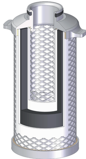
Cross section of the depth filter AX

The specified performance data for the achievement of the compressed air quality classes according to ISO 8573-1 were validated according to ISO 12500-2.