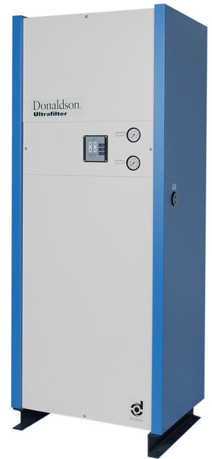
MSD 0005 - 0035 Tropical