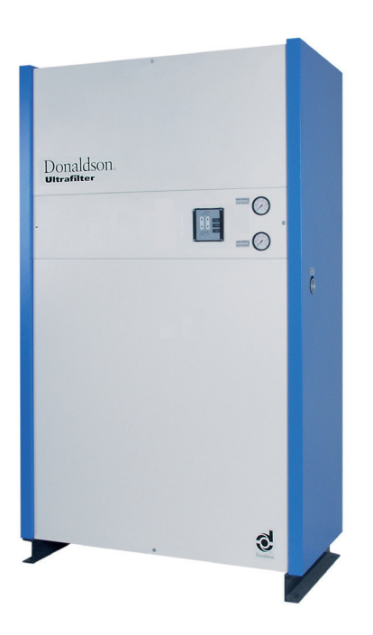
ALG 80 S - 375 S